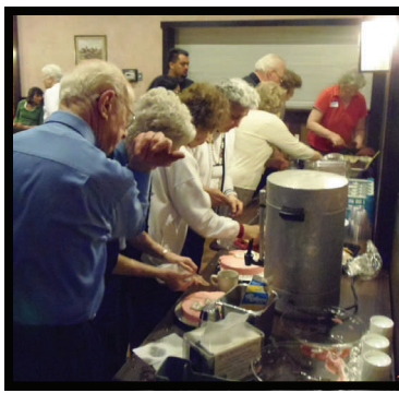
Our Visitors and guests