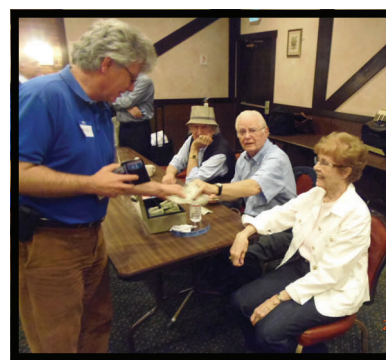
Buying Raffle Tickets