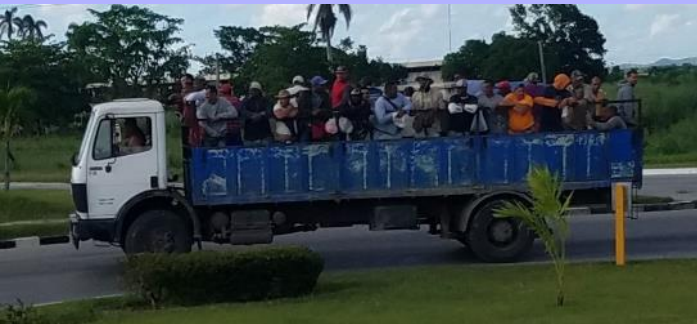
Off to work we go!