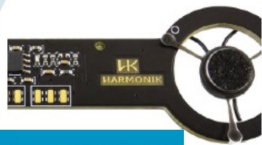
HARMONIK INSTRUMENT MICROPHONE