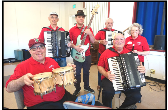
The Sunday Seven