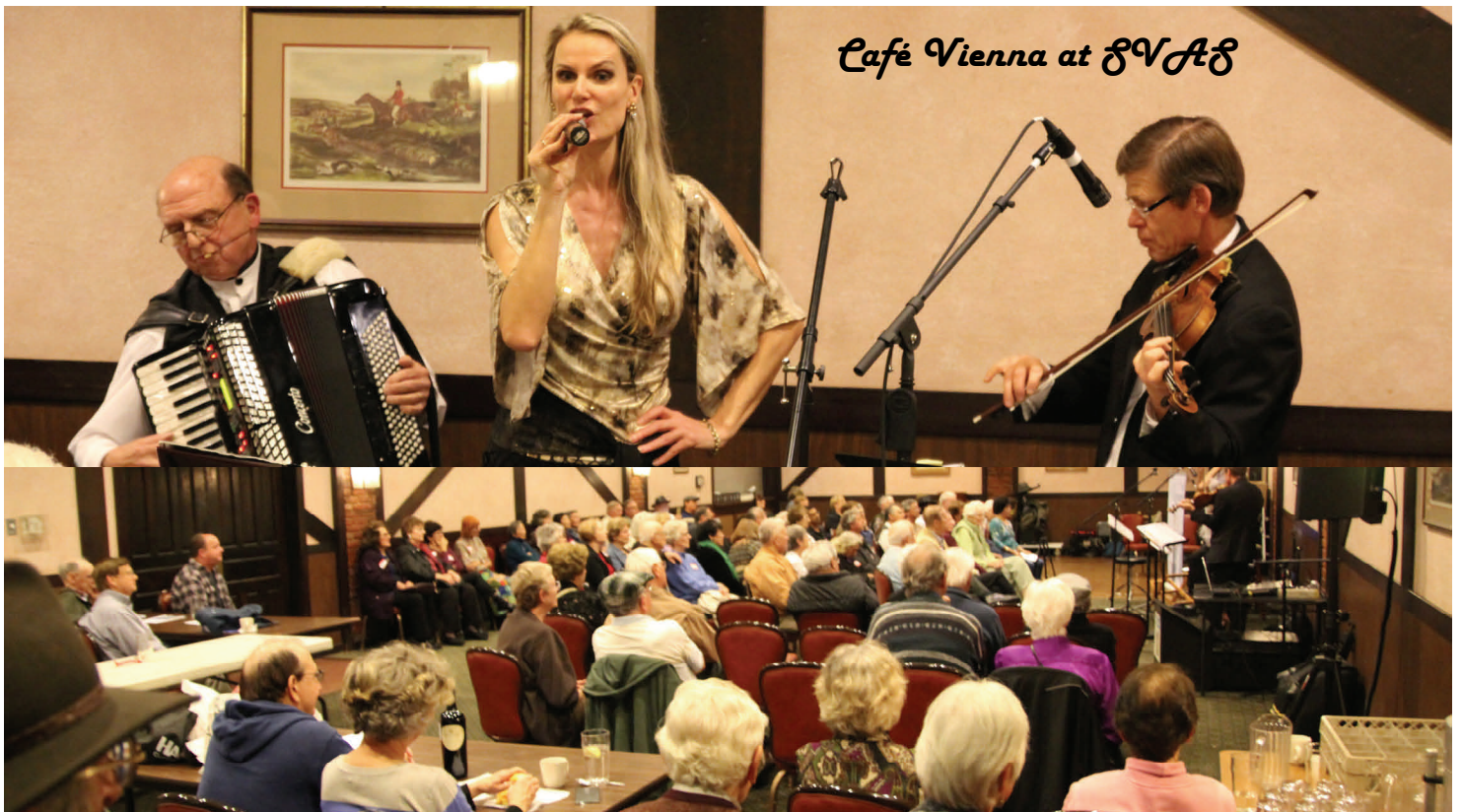
Café Vienna at SVAS

Silicon Valley Accordion Society meetings held first Sunday of each month at Harry's Hofbrau, 390 Saratoga Avenue, San Jose, corner of Kiely. Doors open at 1:00, Music begins at 1:00 pm, Meeting begins at 2:00 p.m. door fee $5, under 16 no charge.