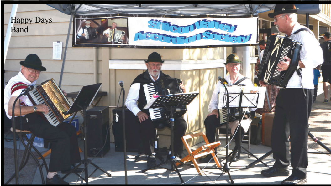
Happy Days Band